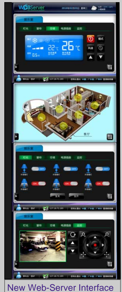
New Web-Server Interface

Smart-HDL has Delivered the Lighting Design for Tiffany Tower - JLT - Dubai. The Concept Design was to Present a Sparkling Crown Jewel Carried By An Array of Fingers in a Hand Which extend from an Arm that is Contained in a Blue velvet Sleeve. Design Used Only 2 Subtle Colors in simple way that do not Hurt Eyes and Always represent a Monumental Land Mark. All Lights are Selected and installed in a way that do not Disturb any of the Tenants inside the Units of the Tower. The Crown However is the Only Dynamic Sparkling Head that act also as Airplane Warning Project Designed By Atkins, and CPMC