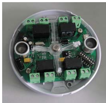
Sensor Inside Component Look