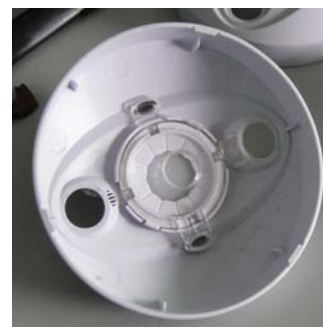
Sensor Cover Looks