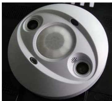
Sensor Shape after Installation